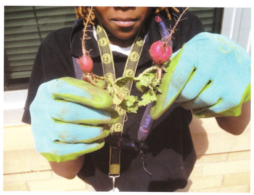
Figure 3. Fruits of their labor.