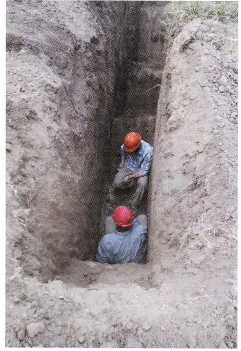
Figure 1. A backhoe dug trench exposing the stratigraphy.

During the 2013 field season, a cross section of the Mustang Pond stratigraphy was exposed across the draw through trenching in order to understand the paleoenvironment of Whiskey Flats better (Figure 1). Interpretation of the stratigraphy can be made to form a basis for past climates and landscapes. Six trenches were excavated within the valley axis, with only three being fully exposed to either the maximum depth of the backhoe or the water table (whichever came first). The stratigraphy at the Lubbock Lake Landmark and other sites within the