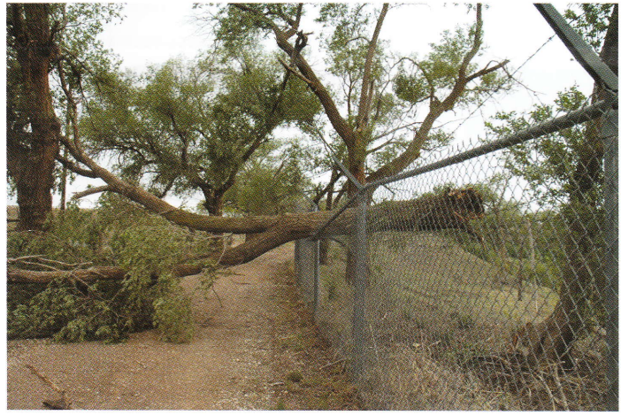
Figure 2. A felled tree along the Archaeology Trail.

abundance of the native species of the prairie environment. The changes wrought by fire take time to become visible and patience to observe (Figure 1).