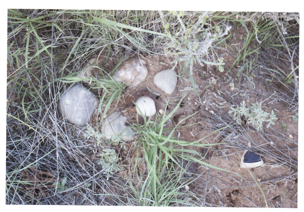
Figure 1. Rock Collection at 4JK8.

The archaeology at 4JK8 provides an important opportunity to document what life was like on the frontier. The site also will provide a glimpse of the interworking's of a family in the early days of West Texas.