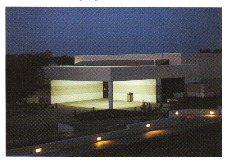
Figure 3. Bob Nash Interpretative Center after dark.

The violent storm that occurred on the night of June 5<sup>th</sup> was one of those unplanned events that bring change. Acres of flooded areas, small rivers of rushing water, roads and driveways blocked by felled trees, structural damage to some of the buildings, and no telephones or power greeted the Landmark staff when they arrived the next morning (Figure 2). Because of the scope of the damage, the Landmark remained closed for several days until any potential danger to visitors from falling trees or debris was eliminated, and that everyone could safely access each of the trails. The immediate clean up took several weeks, and repairs and reconstruction are ongoing.