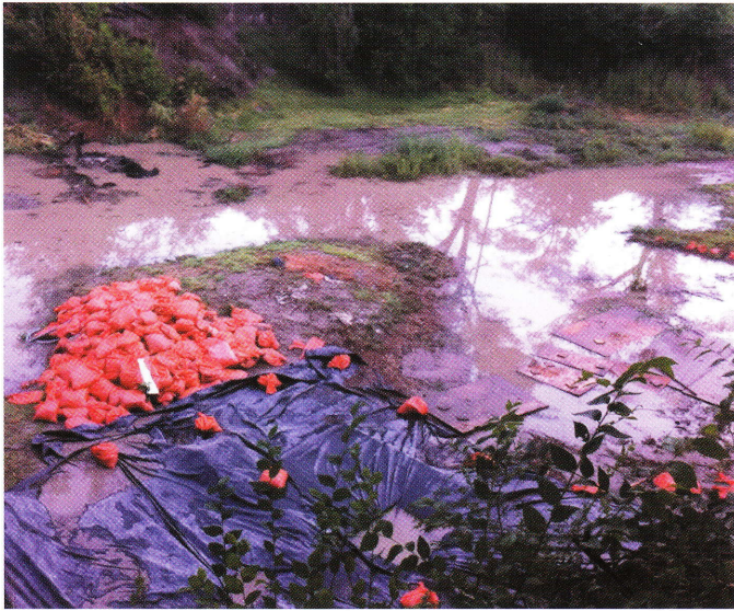
Figure 2. Flooding in Area 6, from above and toward east wall.

Four ancient bison kill events were identified in the excavations during the 1970s and early 1980s, and the field work renewed in 2007 explored the extent of these features to the south of the older excavation area. During the 2013 field season, work focused on bringing the excavation block down evenly below the Firstview period feature (dating to about 8,600 yrs BP) toward the Plainview period feature (dating to about 10,000 yrs BP). The sediment layer was quite thick (about half a meter [20 ins.] deep), and was dark gray and very clayey. The nature of the sediments reflected the marsh environment of the area during these time periods. Although work was between cultural features, valuable information on the nature of the marsh still was collected. Animal remains were abundant in these sediments and provided data that helped to