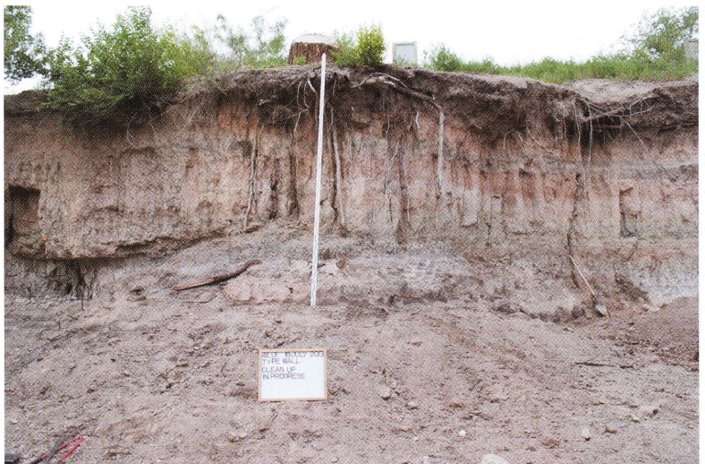
Figure 3. The stratigraphic type wall in the process of being cleared of slump.

While part of the Landmark crew worked in the shaded excavation area, other crew members took to the daunting task of clearing and documenting the valley fill stratigraphic type wall. Stratigraphy refers to the layers of sediments that are deposited through time. Soils can form within these sediments. Soils form when the landscape is stable, or during periods when deposition and erosion of sediments are minimal. Soils also contain organic material and, therefore, can be radiocarbon dated. These dates bracket occupation times when artifacts and features are associated with the soils, as they are at the Landmark. The differences seen in the layers of sediment are due to many factors such as, how they were deposited (e.g., by wind or water) and the state of the overall environment. For the past 30 years, erosion has been taking