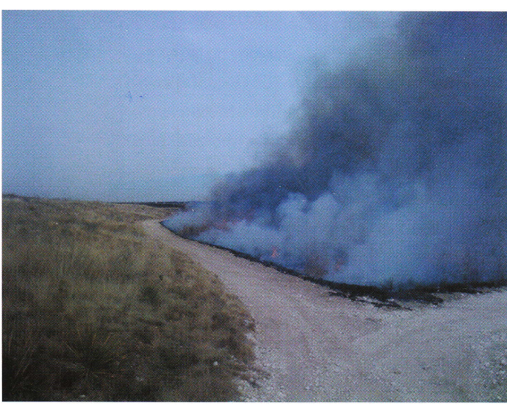
Figure 1. Prescribed burns are used to reinvigorate the prairie.

The prescribed burns at the Landmark have reduced the number of invasive species, making space for a greater abundance of the native species of the prairie environment.