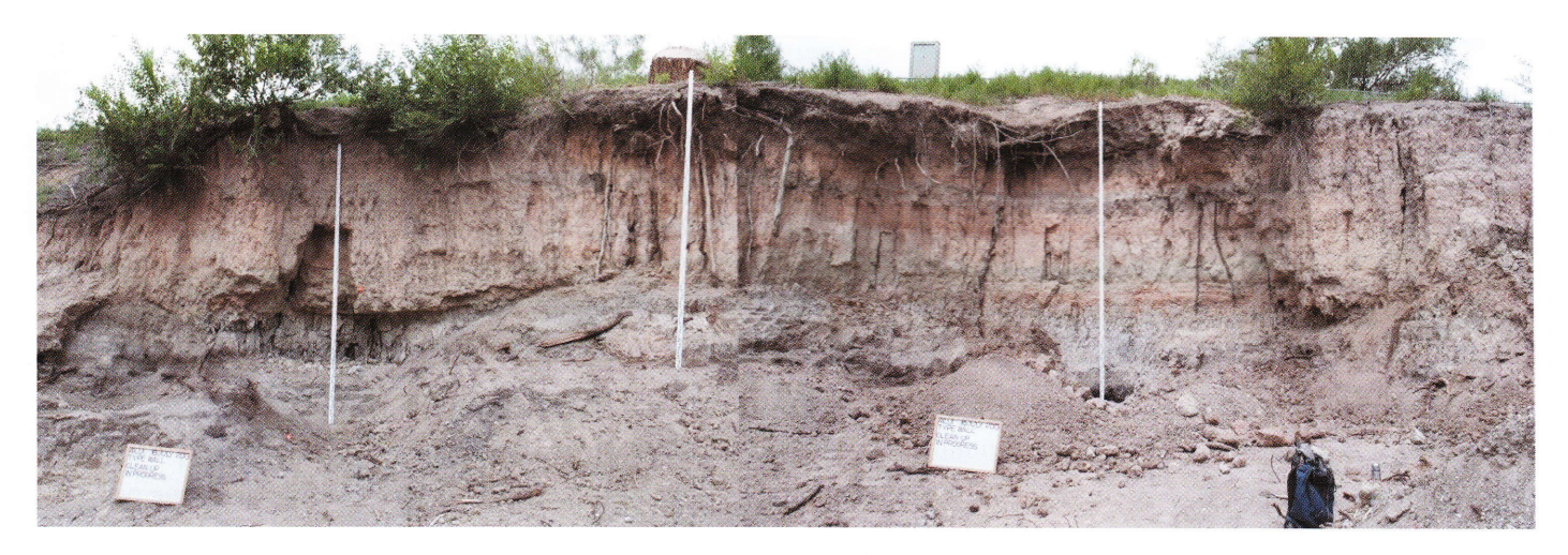
Figure 4. The type section after the bulk of the slump had been cleared away from the wall.

Once the machinery came close to the wall, work had to continue more carefully with shovels and trowels to avoid hitting undisturbed sediment and possible features. Once the wall was exposed, the job of documenting it began. Documentation of the wall required identifying the major stratigraphic units, the substratigraphic units, local bedding (unique, localized expressions of the sediments that occur throughout the Landmark), and the soils formed within the sediments (Figure 4). These units and soils were known for the Landmark because of the many years of geological work done in tandem with the archaeological work. Once the known units were identified in the wall, photographing and profiling began. Profiling was done by mapping the wall onto graph paper to create a scaled version of the type wall. The amount of work required to clean the wall and to document the intricate depositional history of the Landmark was a monumental task that will continue next field season.