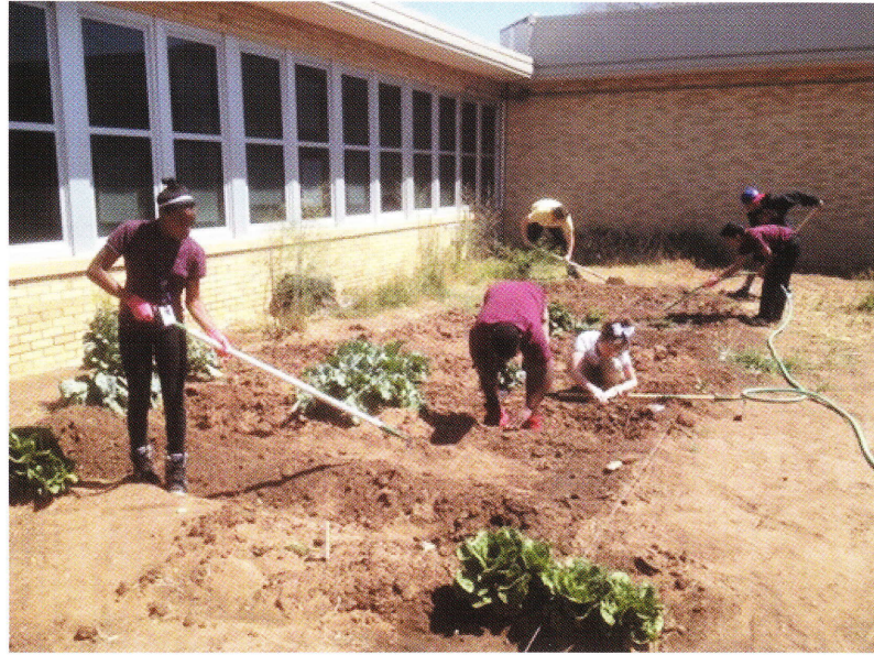
Figure 1. Students as gardeners.