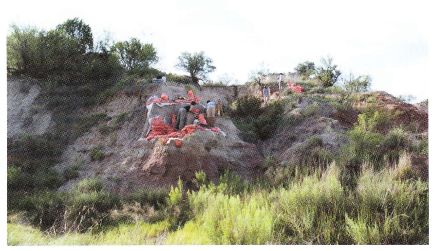
Figure 1. Macy Locality 100 (foreground), with the tortoise excavation in the background.

The 2013 field season marked another summer of exciting discovery at the late Pleistocene Macy Locality 100 (Figure 1). This year represented the 5th consecutive season of annual excavations at the ancient locality in Garza County, Texas. Over these past several seasons, Lubbock Lake Landmark field crews accumulated evidence of the past environment and animal communities that existed at the southeastern edge of the Llano Estacado. The remains of a diverse array of animals recovered from Macy 100 were associated with radiocarbon dates between 12,190 and 10,730 yrs. B.P. During the 2013 field season, the field crew focused their efforts on the continued