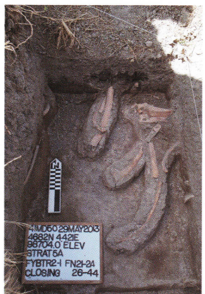
Figure 2. Bison bone bed in situ.

Excavation of trench 1 was dug to the limits of the backhoe; stratigraphic units 3, 4, and 5 were exposed. Bison and modern horse bones were recovered at the top of trench 1 in stratigraphic unit 5. Trench 2 excavation immediately uncovered bison bones (Figure 2). When this occurred, the backhoe stopped and moved down the line a couple meters to continue trenching. After moving down the line several times and continuing to encounter bone each time, the backhoe operator moved on to the location for trench 3. In trench 3, more bison bone was unearthed and all backhoe operations were called to a halt until later in the week. With the exposure of in-situ bison bones, excavation units were placed in trench 2 to remove the bone in order to continue trenching.