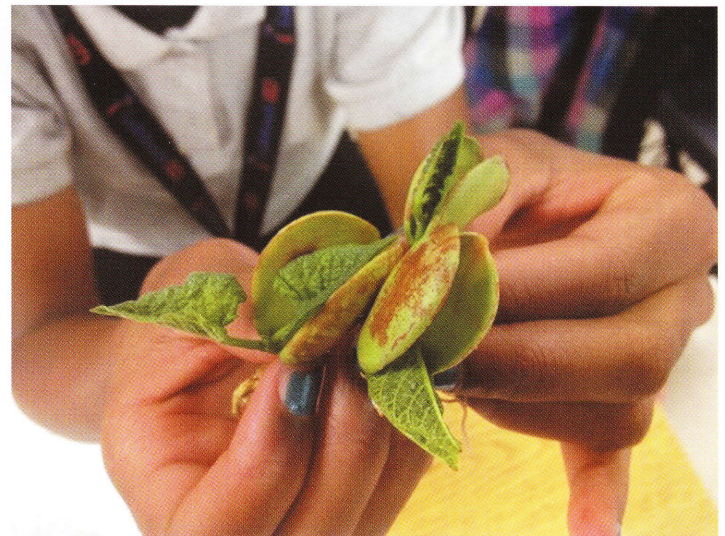
Figure 2. Learning the science of plants in the classroom.

Our class consisted of 15 students in a 6th grade science elective. They greeted us warily, keeping us at a distance with sharp humor and flippant attitudes. The