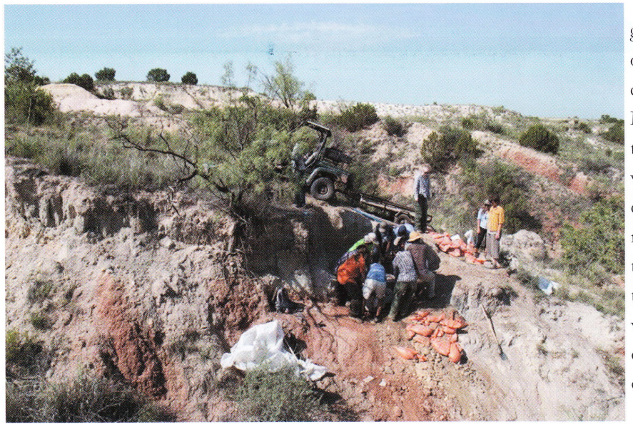
Figure 2. The field crew straining to drag the tortoise plaster jacket out of its excavation.

excavation of the main area as well as excavation of a new area containing an extinct giant tortoise.