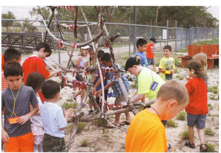
Figure 2. \it Life~as~a~Paleo indian, practicing~traditional~cooking~methods.

summer programs proved to be a great undertaking. Registration opened in May and was full within a couple of weeks. My favorite week was Gone to Texas , focusing on Texas regions and overland travel to Texas in the 1800s. Activities included building cardboard wagons, making decisions about supplies to take along the journey, loading the wagons, and an overland travel obstacle course (Figure 1). The National Ranching Heritage Center loaned us a log cabin so the